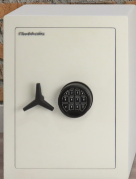
MODEL SHOWN: HOMEVAULT S2 PLUS 55 EL